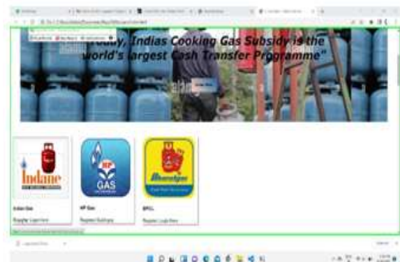
Fig 10. Using different gas agencies

F. Consumer can register for different gas providing company