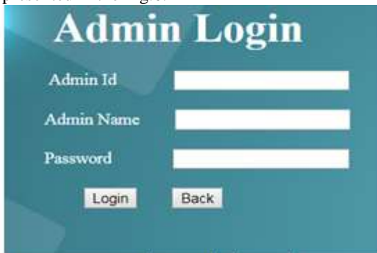
Fig.6. Admin Login

B. Admin can Register at first then he/she can login through the Id's with the rename and password. The process is represented in the Fig.6.