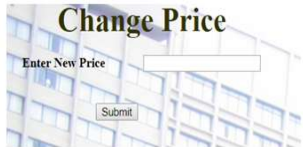
Fig.9. Price changes

E. Dealer has the accesses to change the price as per their stocks and governance.