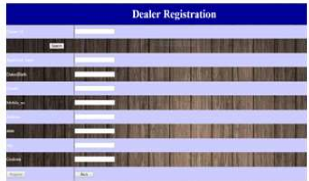
Fig.8 Dealer registration

D. Dealer registration done using the interface created by us and can add their availability as shown in the fig.8