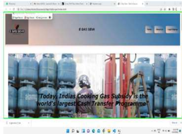
Fig5. User Interface

B. Admin can Register at first then he/she can login through the Id's with the rename and password. The process is represented in the Fig.6.