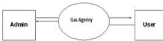
Fig 1 System overview

5.Consumer Feedback: After the successful delivery of the product the consumer can give their experience about the service and as well as the delivery person for their job. In Fig 2 the proposed framework is viewed.